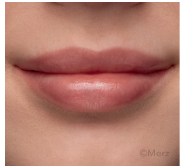
5 weeks after treatment