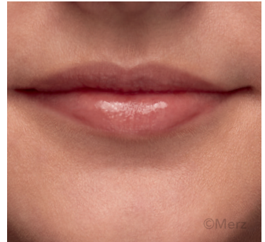
5 weeks after treatment